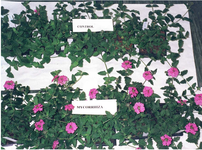
Inoculated (bottom) plants of Verbena showed highly significant increase in flowering compared to uninoculated plants (top) of the same age.