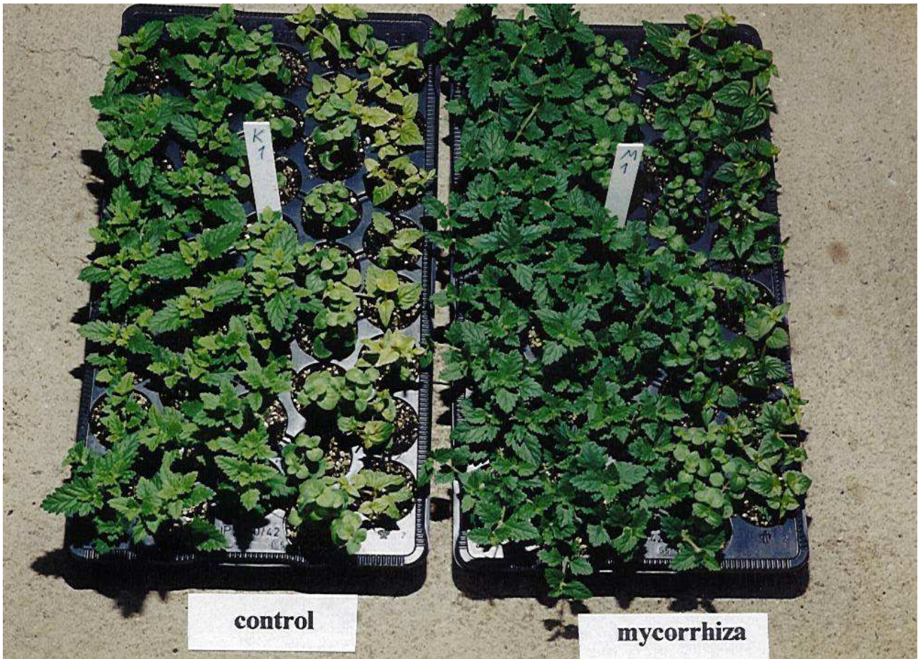
Uninoculated, i.e. control (left) and inoculated (right) plants of Verbena , Torenia and Diascia - already at early stages of propagation there was a visible effect of mycorrhizal inoculation